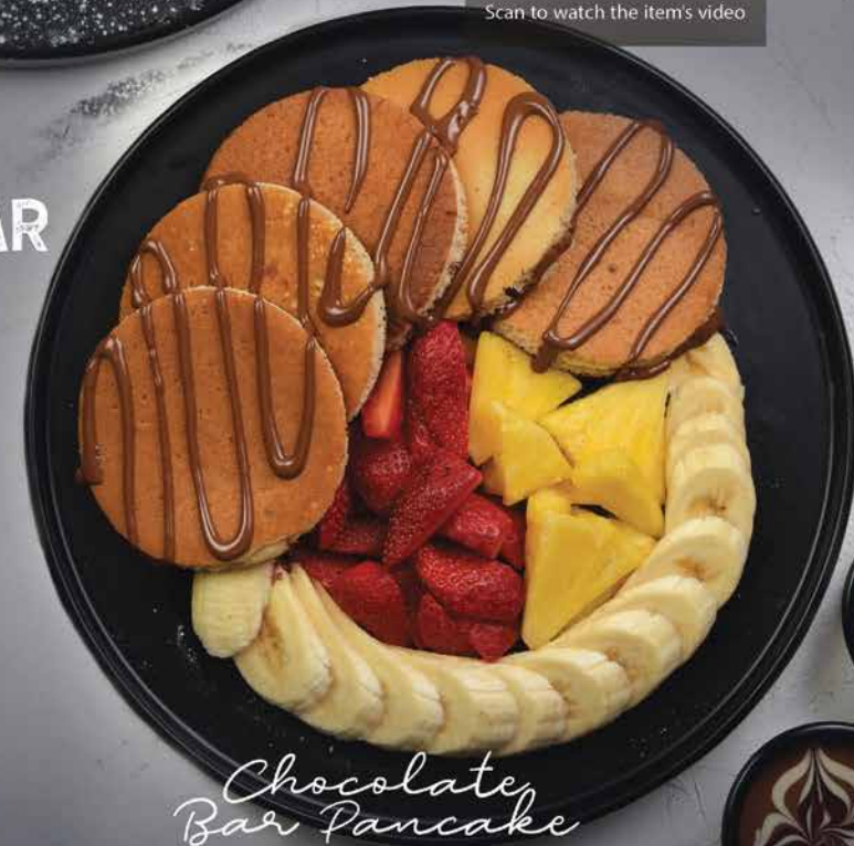
Chocolate Bar Pancake